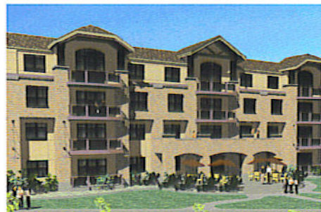
PLAZA CONDOS DESIGNED BY CHAD PHILLIPS

for our later architecture. To achieve the luxury living that we, as a community have grown accustomed to, we also utilize our highly energy efficient patented heating & cooling system. It has been a joy integrating highly efficient design with national award winning architecture. The end result is a new architecture reflective of our needs, passions and diversity of life.